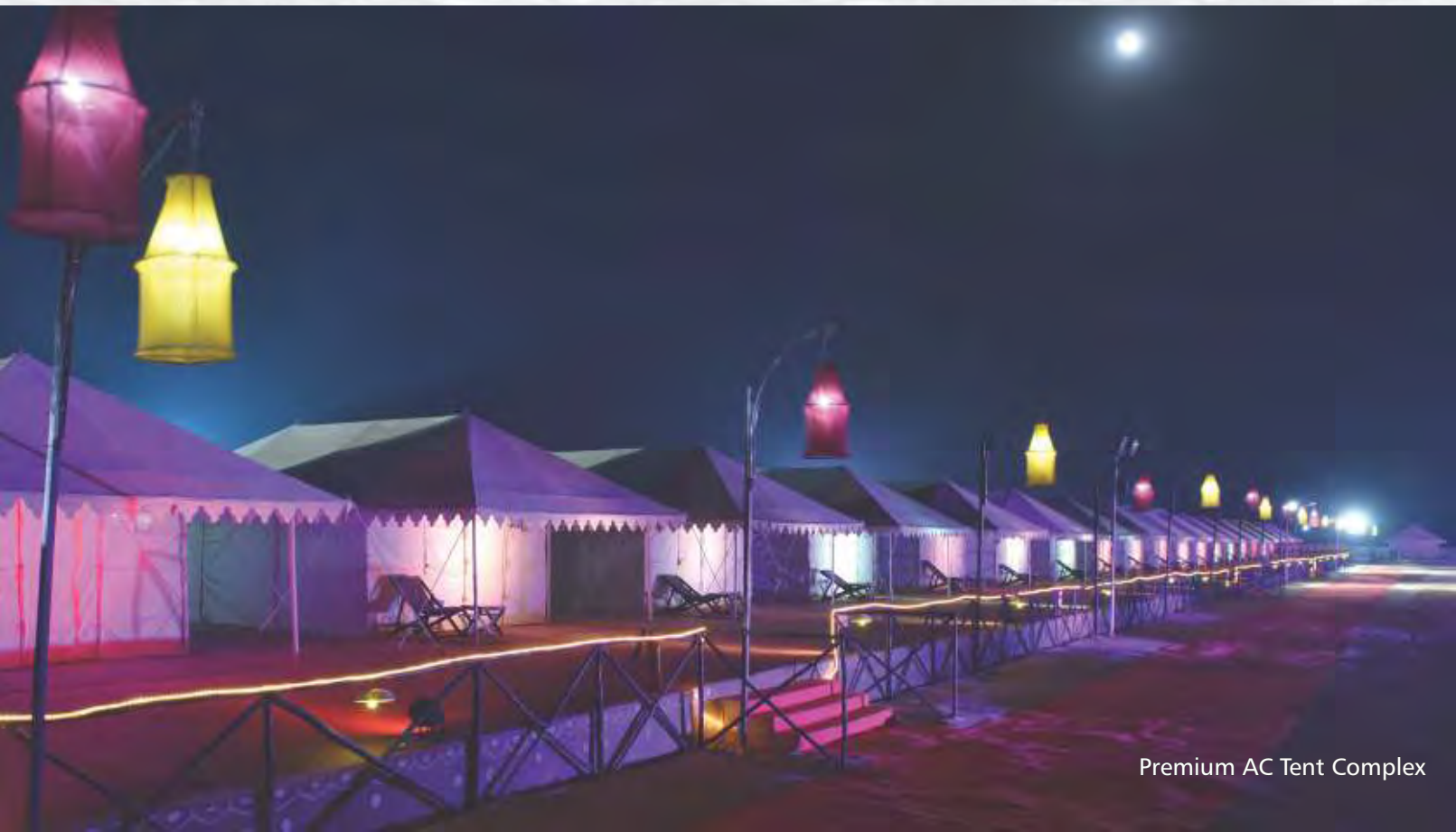
Premium AC Tent Complex