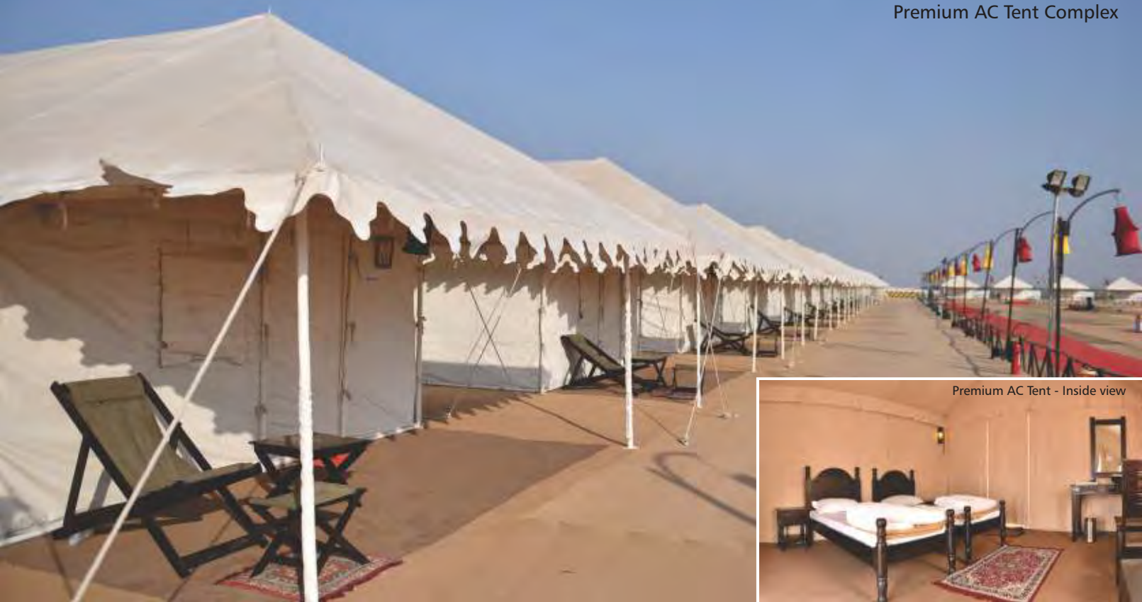
Premium AC Tent - Inside view